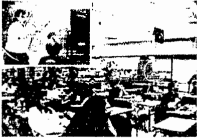
Figure 3. Excerpt from a video case

for the pre-service student team is to redesign the instructional plan of the unit, within practical constraints, from multiple learning-sciences perspectives and justify that redesign in scientific terms. As an example, Figure 2 shows part of a page about cognition that students can learn about. Students post their team's redesign and explanation on a web conference site for peer evaluation and consultation with experts, including scientists and educational experts.