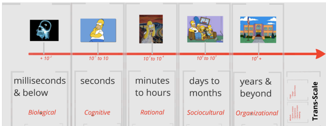
Figure 1. Log 10 time scale of human learning. Adapted from Nathan & Alibali (2010).

LS studies learning across levels of space, time, and scale. Figure 1 (adapted from Nathan & Alibali, 2010) reflects one way to visualize the unified nature of learning phenomena, as they emerge through variation of only a single parameter: Time (Newell, 1990). From an individualist psychological perspective, what unifies all learning phenomena is a set of shared mental processes . In contrast, LS holds that what unites them is that learning occurs in the context of designed learning environments -- classrooms, the home, workplaces, even the psychology laboratory. In each case, the learning environment is an artifact designed in an historical context, in response to cultural constraints and expectations, which is intended to bring about some societally desirable learning outcomes.